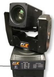
PTX Model 1 or 2