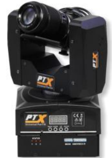
Blackmagic Micro Studio Camera 4K