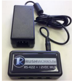
RUSHWORKS MUX 12VDC / RS-422